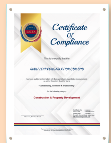
Certificate of Compliance