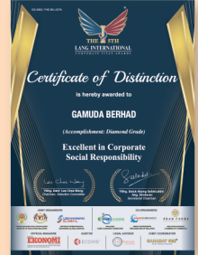
Certificate of Distinction